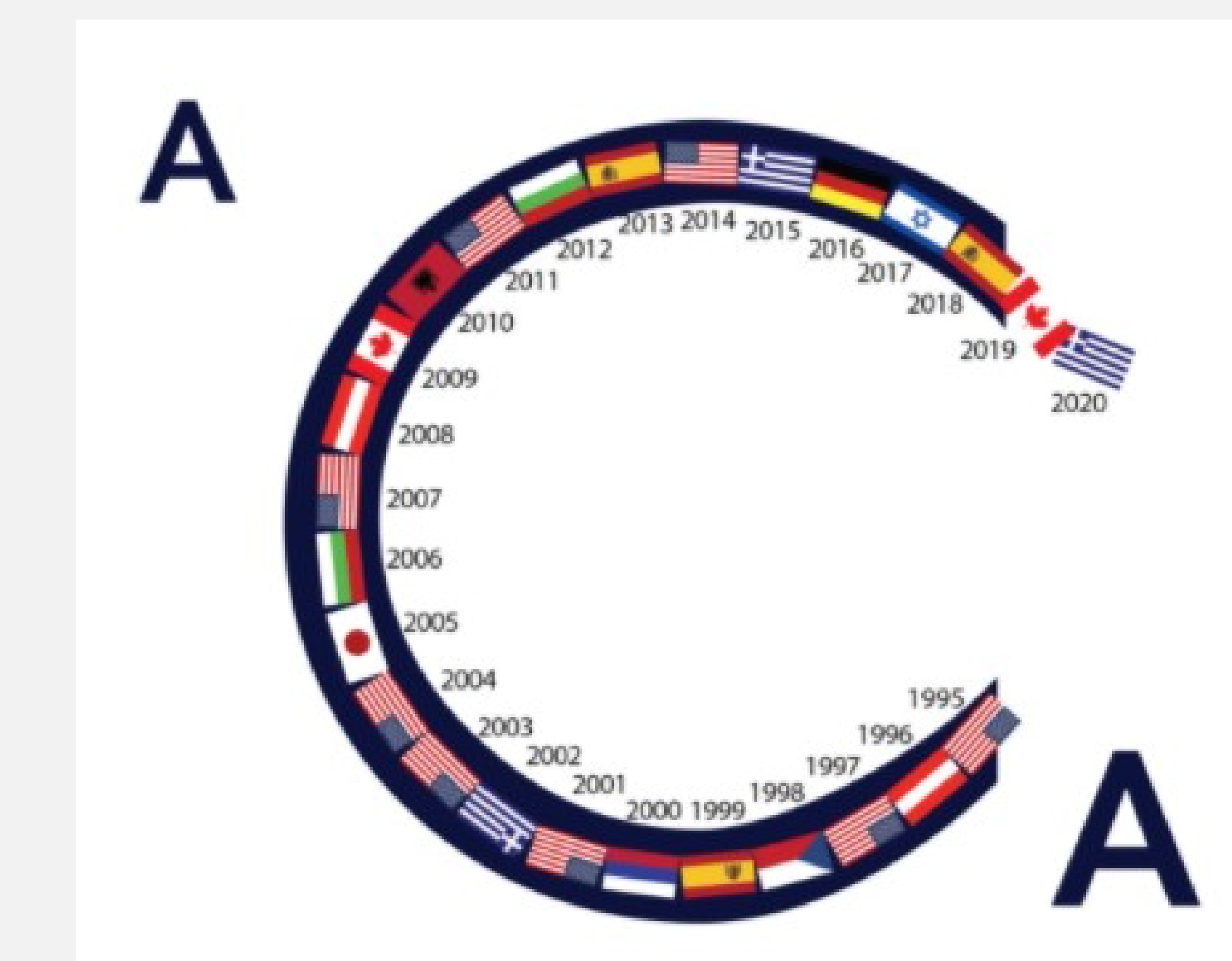
Countries of the first 25 ACA conferences