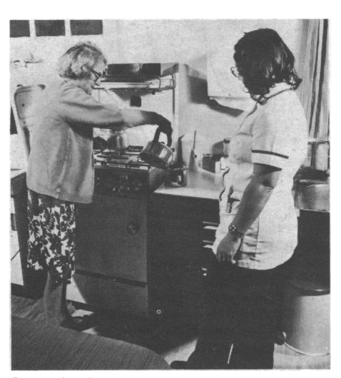
Occupational therapy kitchen area in the Central Middlesex Hospital's upgraded acute geriatric unit, an important feature of which is the rehabilitation room. Mr David Ennals unveiled a plaque commemorating the formal opening of the new unit on 24 February.

employment rehabilitation centres. The commission plans to extend the training opportunities scheme, especially for the young and for the less able, and to survey the extent of unmet training needs. For severely handicapped people places in sheltered workshops are to be increased by up to 200 a year. The help offered by the commission includes the permanent loan of aids such as special typewriters and chairs. The full version of the report and a summary booklet may be obtained from the Employment Service Agency, 82 Charing Cross Road, London WC2H 0BT.